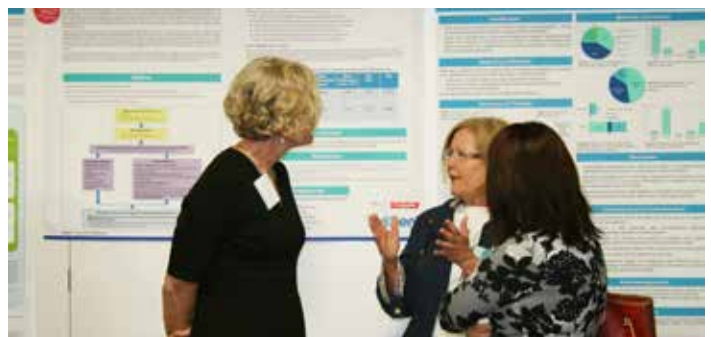
eviDent posters create discussion amongst guests